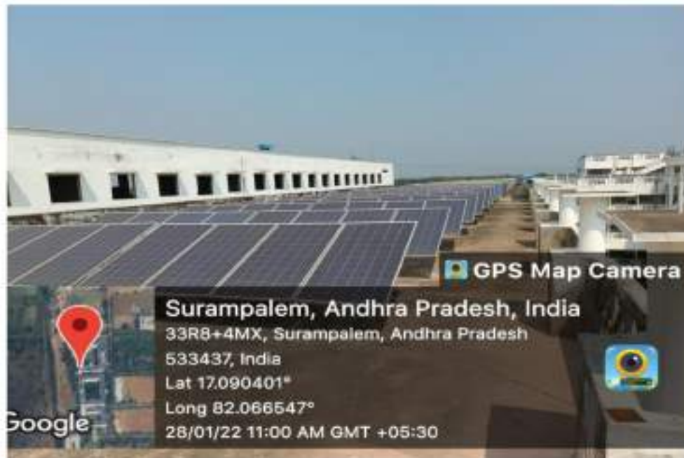
Solar Panel on roof top of Newton Bhavan

Aditya Nagar, ADB Road, Surampalem - 533 437, E.G.Dist., Ph: 99631 76662.