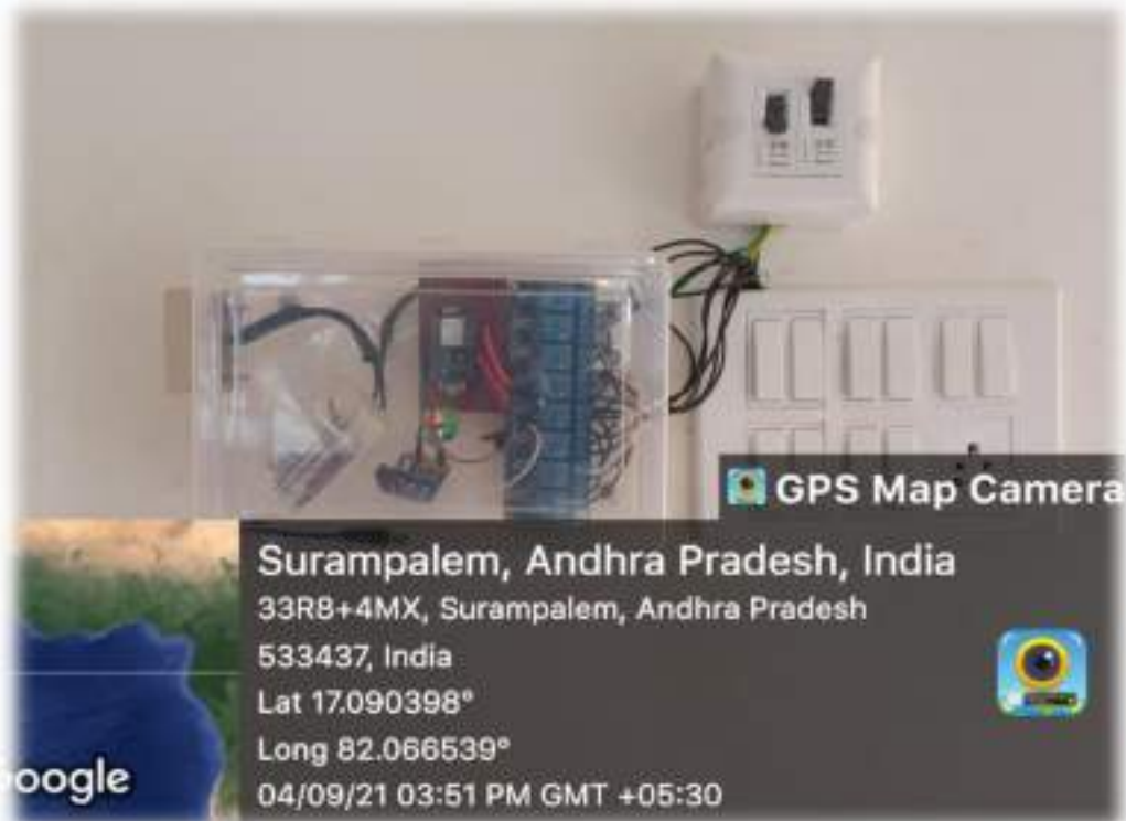
Sensor based equipment installed in Ramanujan Bhavan

Aditya Nagar, ADB Road, Surampalem - 533 437, E.G.Dist., Ph: 99631 76662.