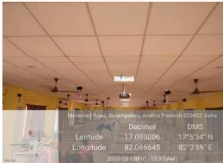
LED bulbs in Seminar Hall

Aditya Nagar, ADB Road, Surampalem - 533 437, E.G.Dist., Ph: 99631 76662.