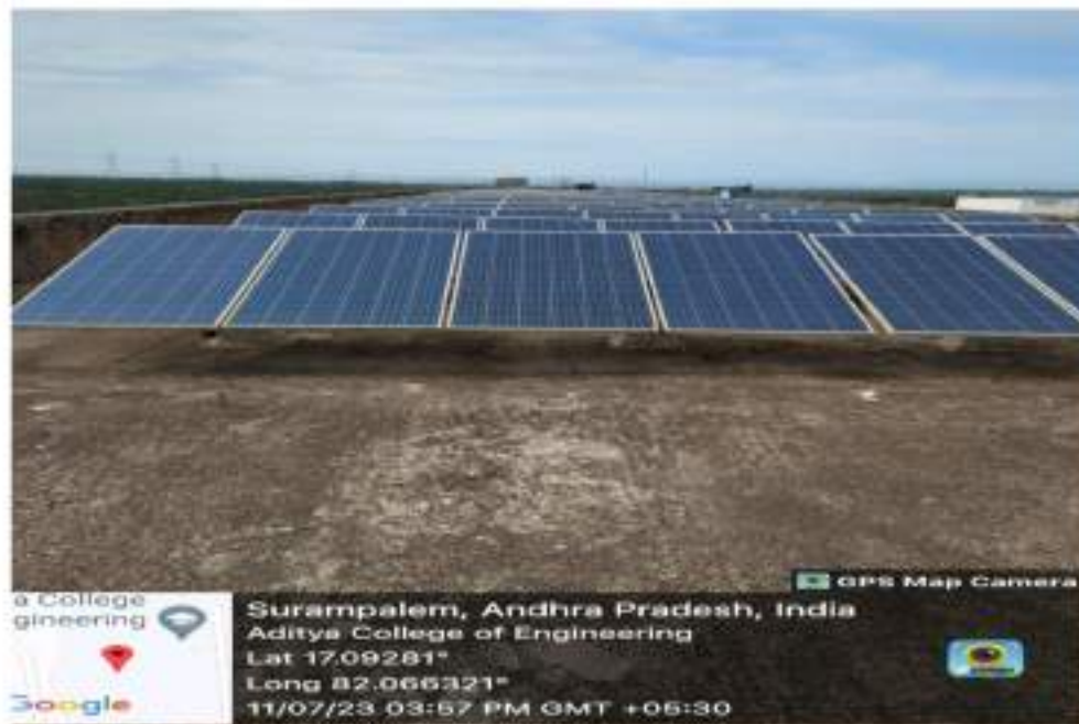
Solar Panel on roof top of James Watt Bhavan