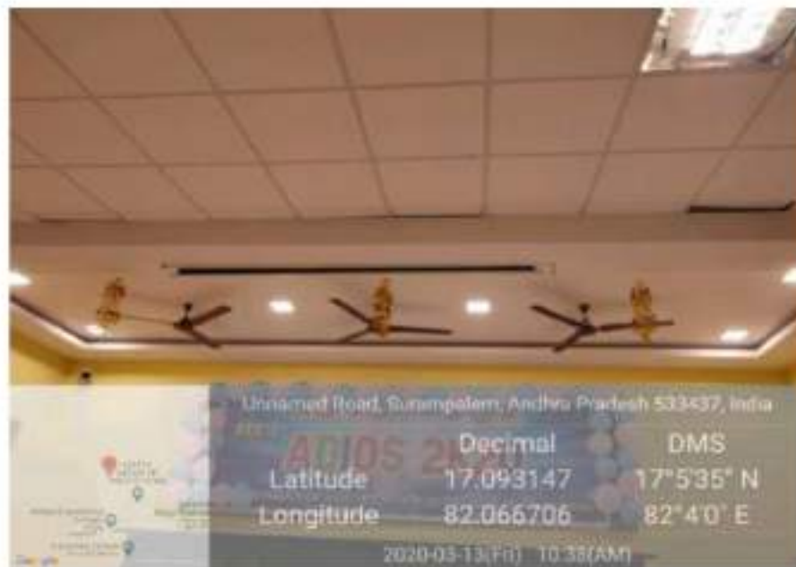
LED bulbs in Seminar Hall