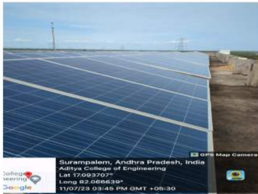
Solar Panel on roof top of Ramanujan Bhavan