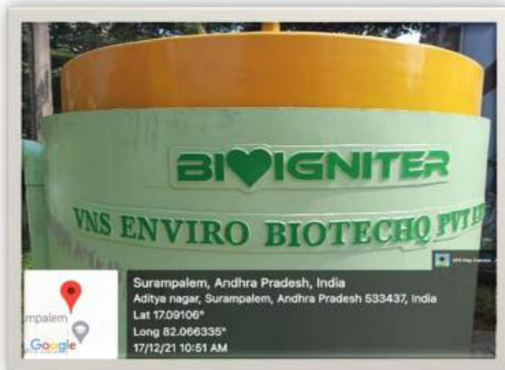
BIOGAS PLANT AT RAMANUJAN BHAVAN CANTEEN