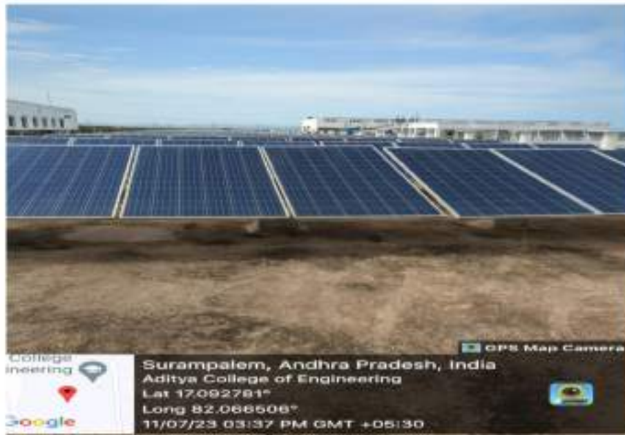
Solar Panel on roof top of Ramanujan Bhavan

Aditya Nagar, ADB Road, Surampalem - 533 437, E.G.Dist., Ph: 99631 76662.