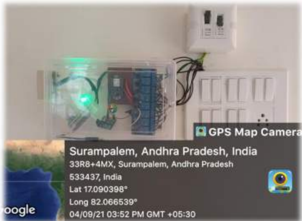
Sensor based equipment installed in Ramanujan Bhavan