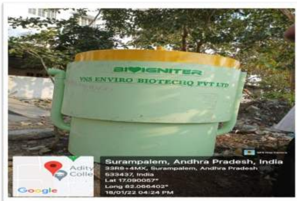
BIOGAS PLANT AT RAMANUJAN BHAVAN CANTEEN

Aditya Nagar, ADB Road, Surampalem - 533 437, E.G.Dist., Ph: 99631 76662.