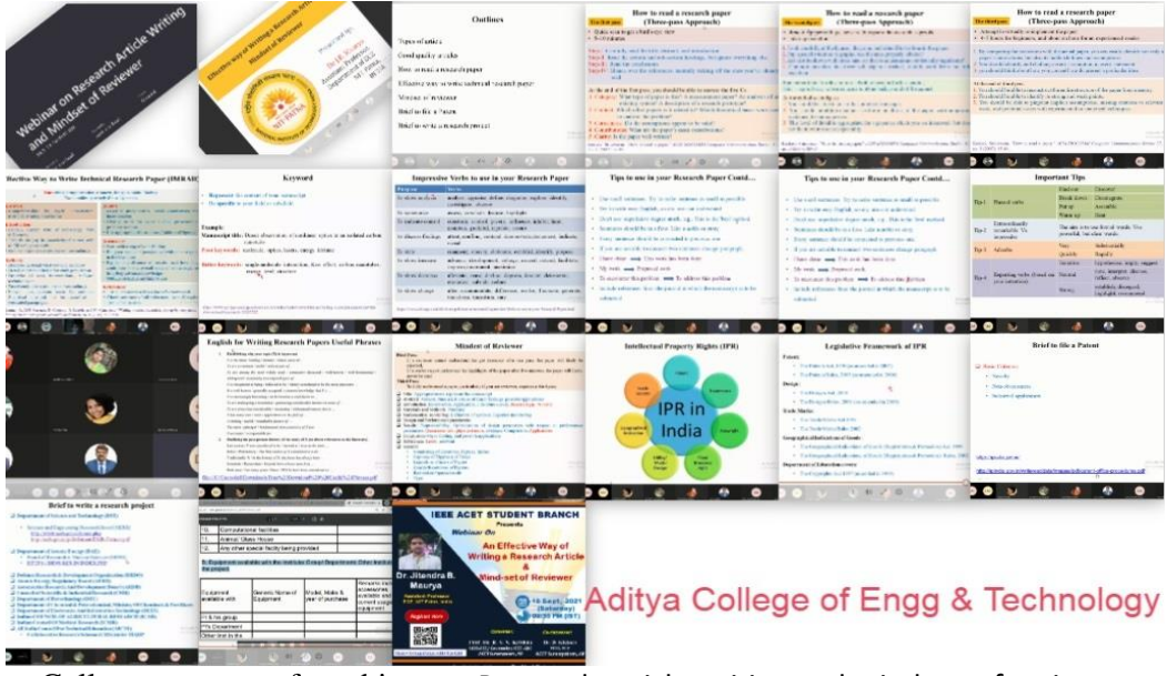
Gallery coverage of webinar on Research article writing and mind set of reviewers