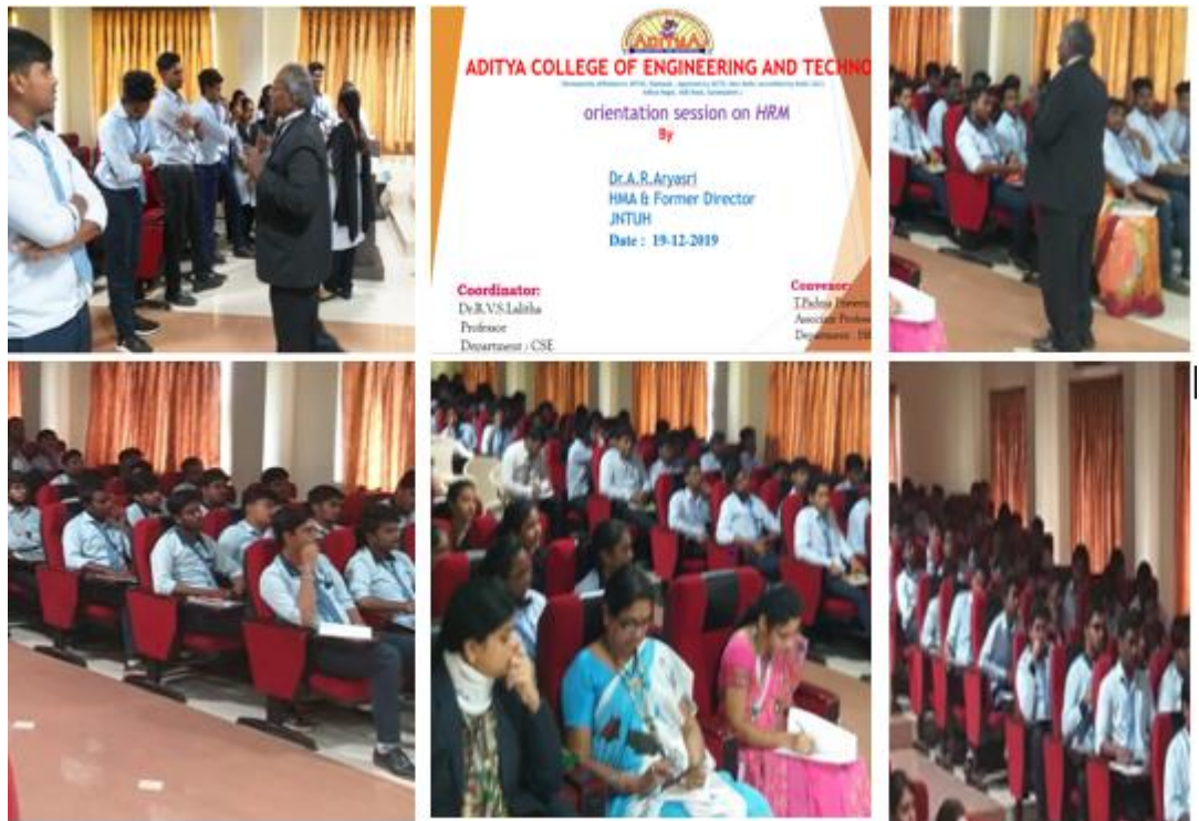
Gallery coverage of HRM