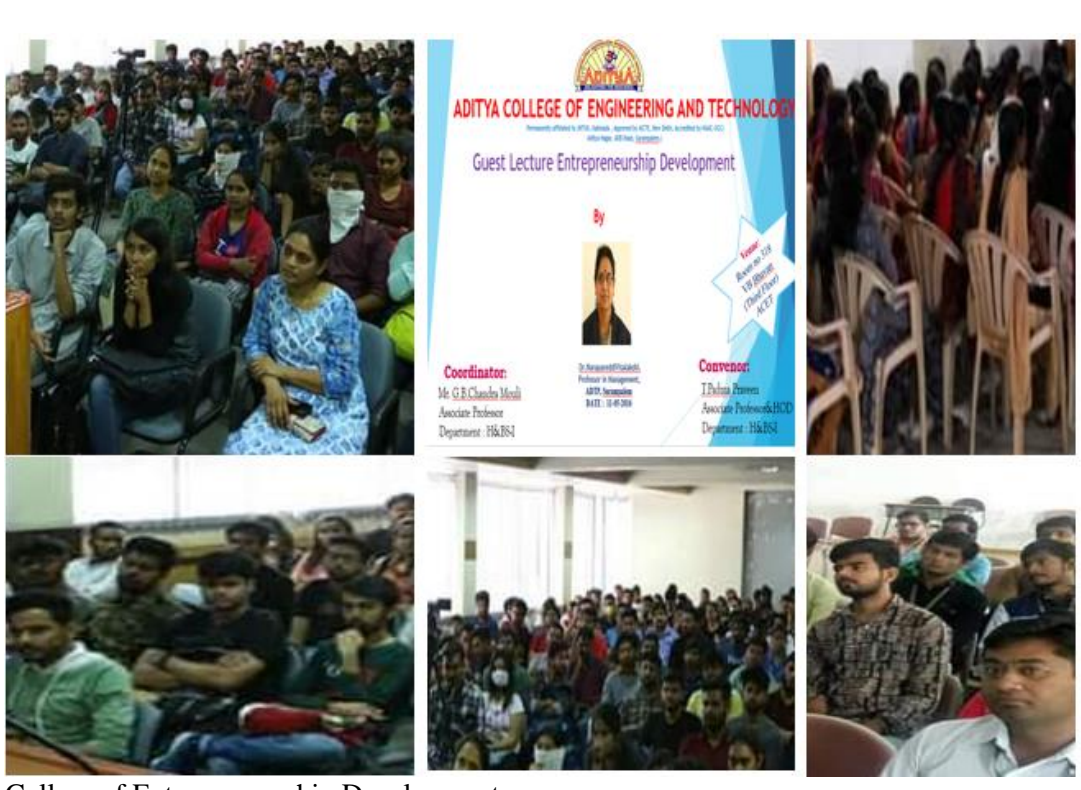
Gallery of Entrepreneurship Development