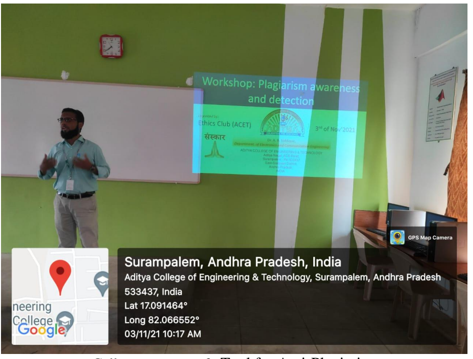
Gallery coverage of Tool for Anti-Plagiarism

ADITYA COLLEGE OF ENGINEERING & TECHNOLOGY Aditya Nagar, ADB Road, Surampalem - Pin:533437 East-Godavari District, Andhra Pradesh, INDIA.