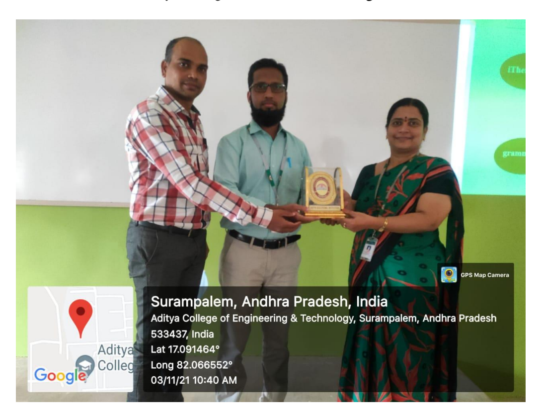
Gallery coverage of Tool for Anti-Plagiarism