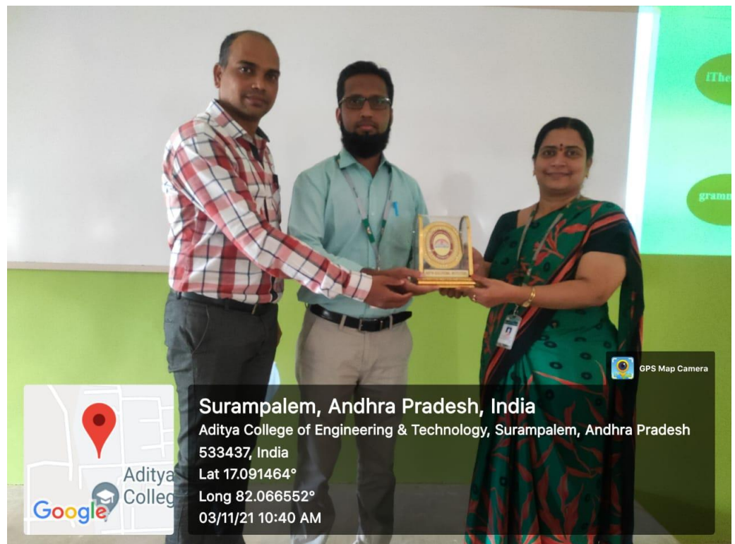
Gallery coverage of Tool for Anti-Plagiarism