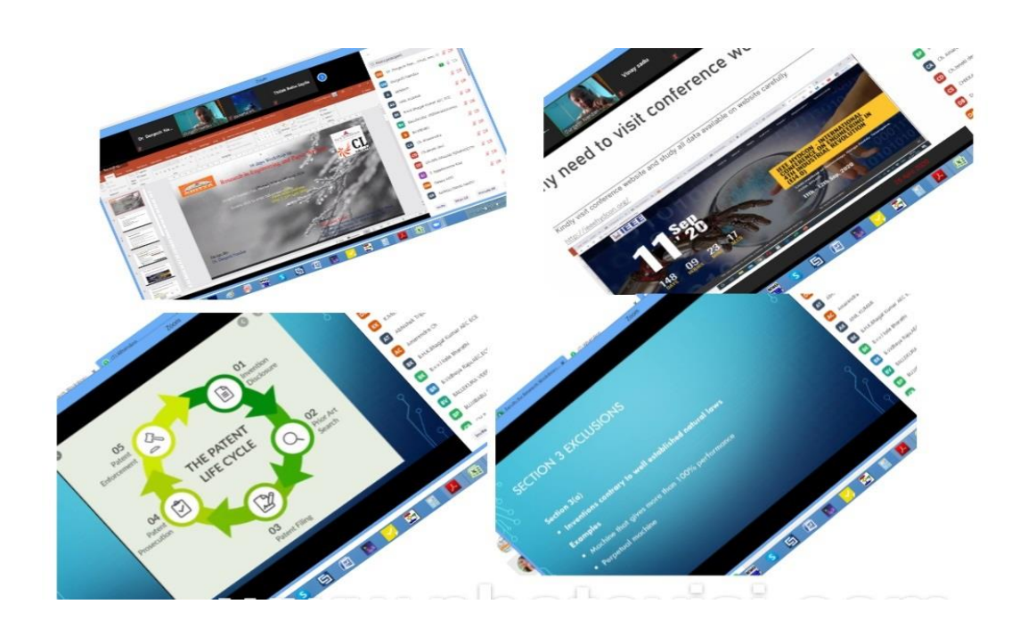
Gallery coverage of webinar on research writing and Patent filling