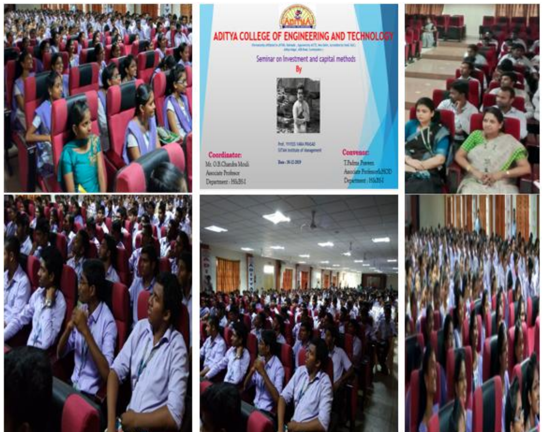
Gallery coverage of Investment and capital methods