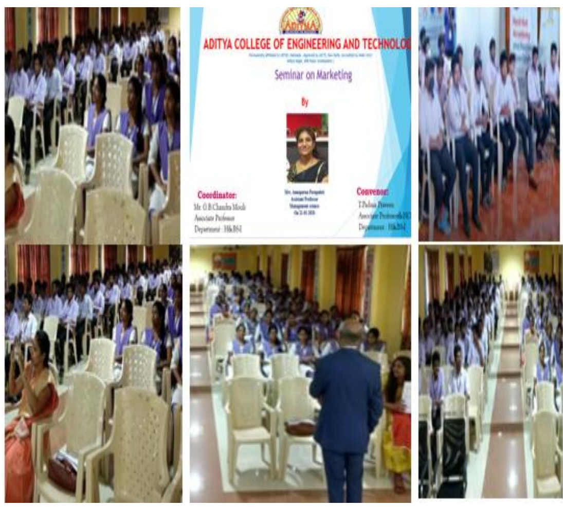
Gallery coverage of Marketing