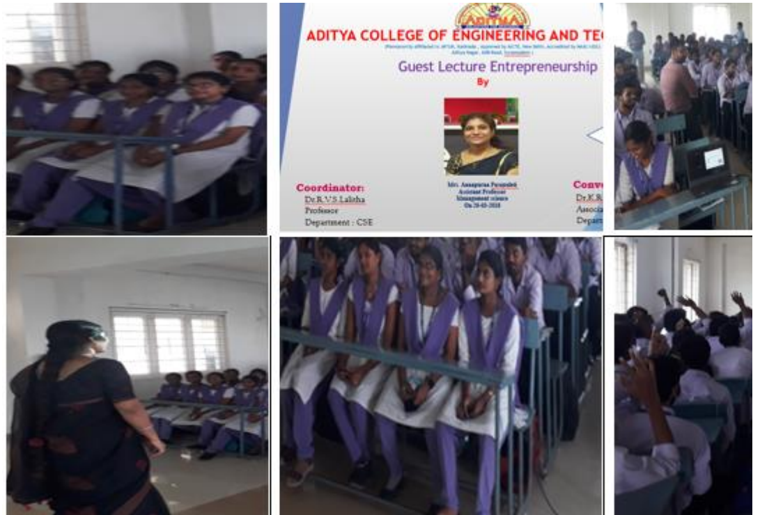
Gallery coverage of Entrepreneurship