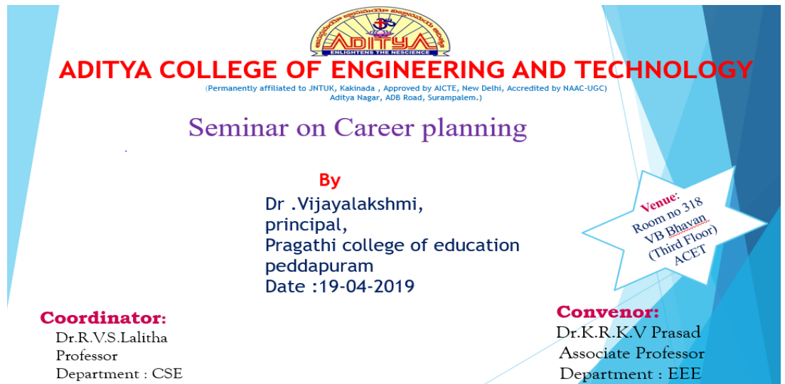
Gallery coverage of Career planning