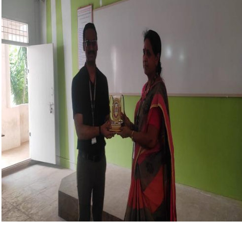
Gallery of Stock Market Operations