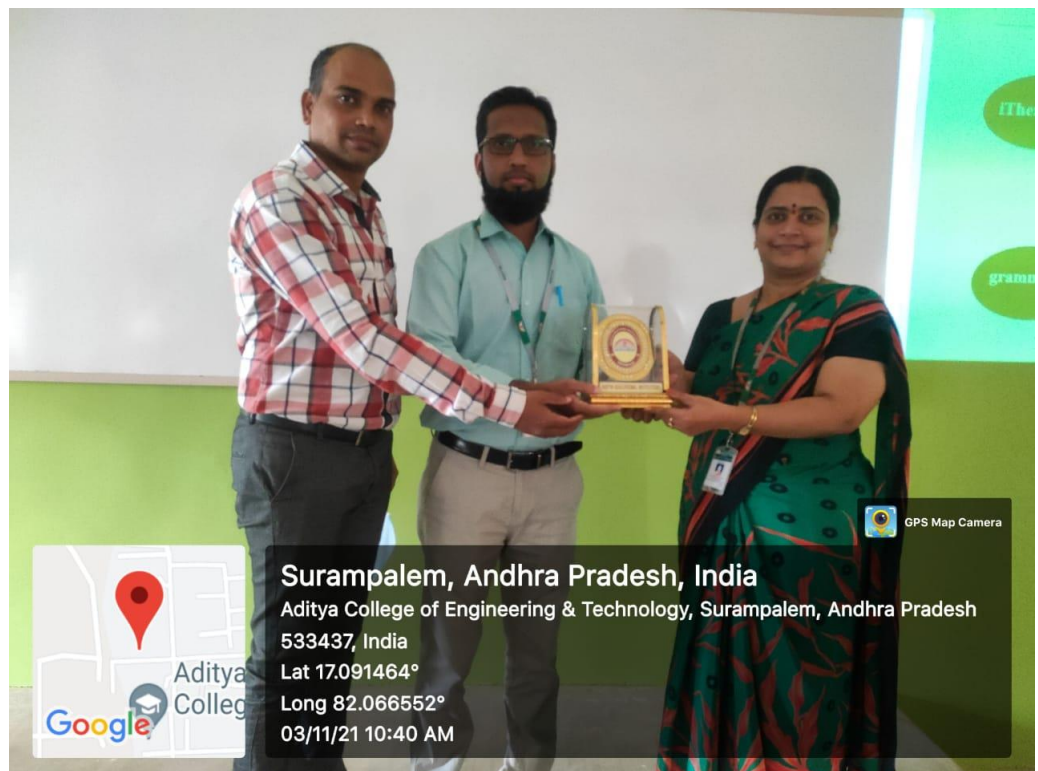
Gallery coverage of Tool for Anti-Plagiarism