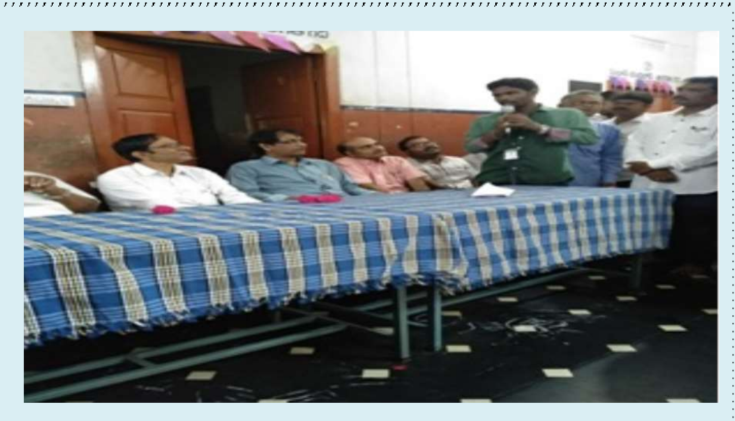
COMMUNITY PLEDGE AT ANNURU PANCHAYATI