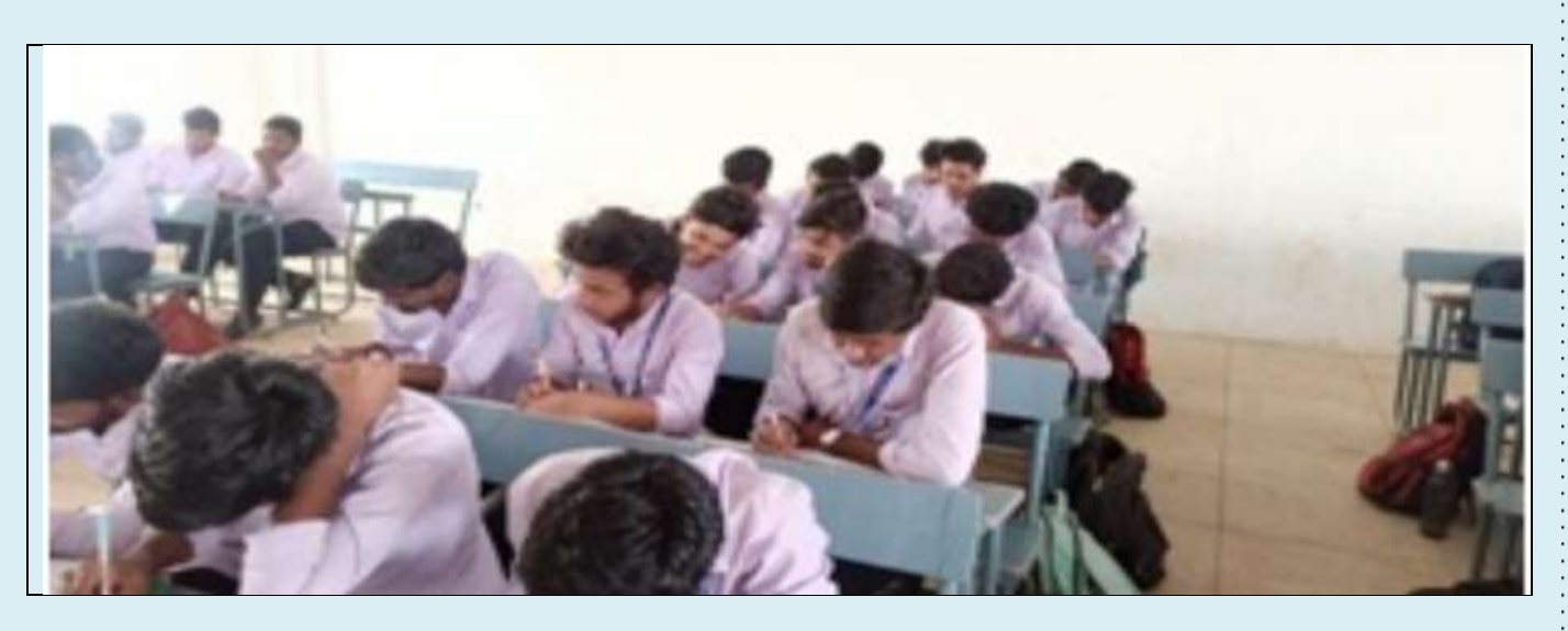
NSS Coordinators, Student Volunteers Conducted Quiz on Yoga