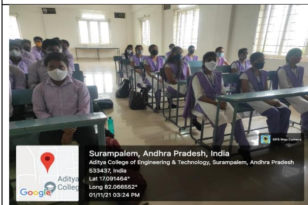
Students in Orientation Programme