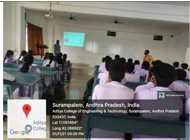
Students interaction with the Resource Person