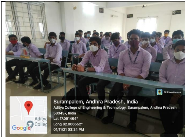
Students listening to the Resource person