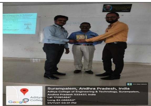
Presenting Memento to Resource Person