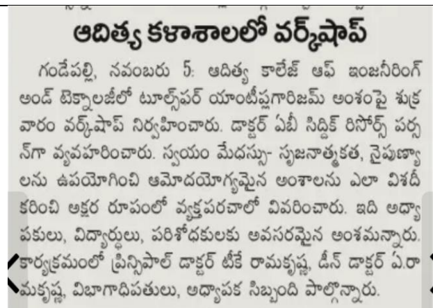
News Paper Article about the Programme