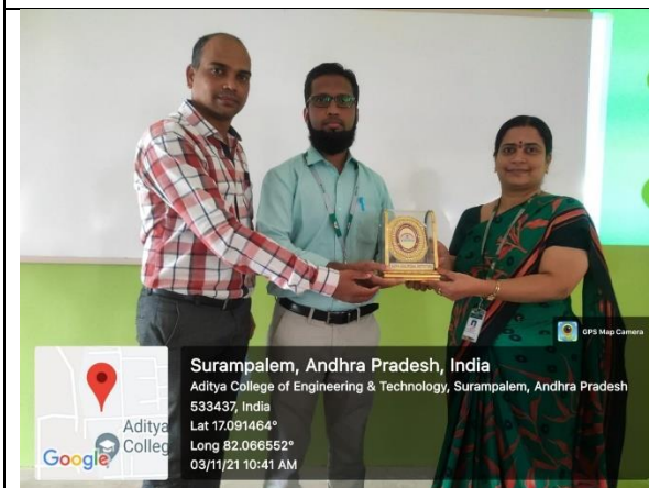
Presenting Memento to the Resource Person