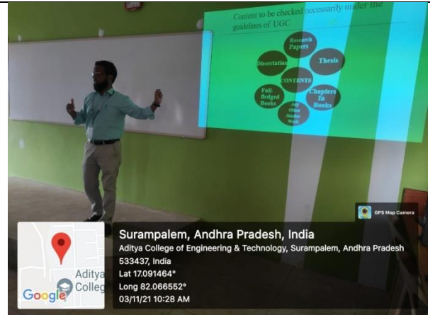
Resource person with the Presentation