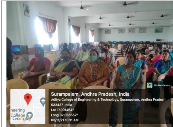
Faculty listening to the Resource person