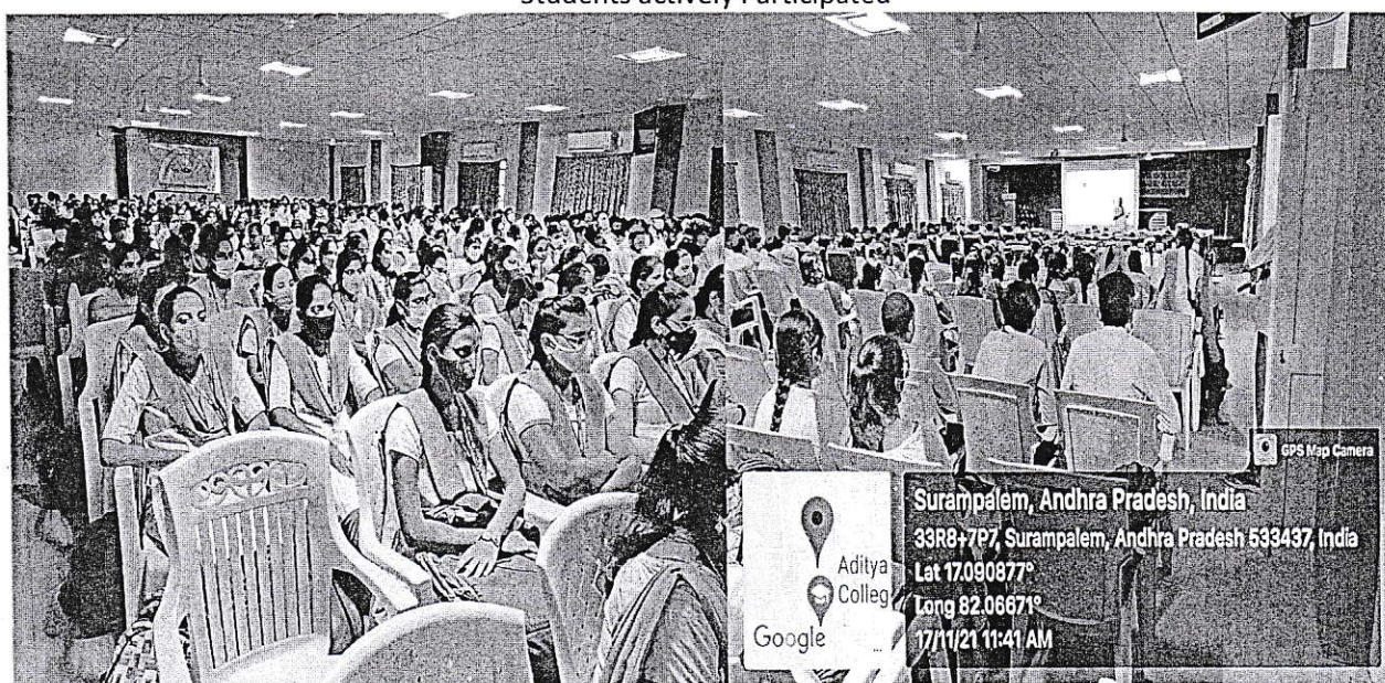
Students are interacted with resource person