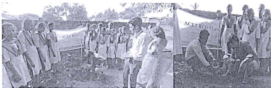
Planting a tree by faculty member