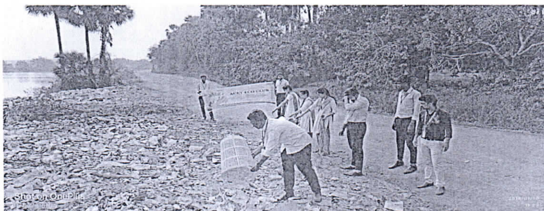
Dumping the collected waste in the dumping yard