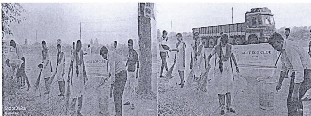
Cleaning the ADB road side area and collecting it in dustbins

A Healthy Environment makes Healthy living. Every individual needs to maintain a clean and healthy environment. Eco Corps of ACET Eco-Club took a step in maintaining a clean environment in and around campus. The event was located at the ADB road, surampalem on 10-01-2016. The participants have actively cleaned the roadside, and the collected waste was dumped in the dumping yard. All the student members and the B-tech students, members, and coordinators of the Eco-club totally of 38, enthusiastically participated in the cleanliness drive. The main aim of the cleanliness drive is to bring awareness in students to protect the bounty of soil and practice healthy habits.